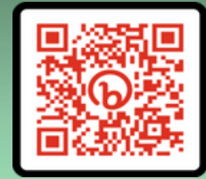
Free ACT Practice Test & Resources