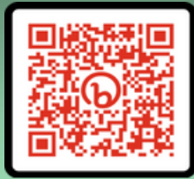
Student Services Website