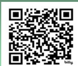
Parent Power School