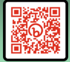
Federal Student Aid