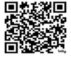
Herff Jones : Cap&Gown