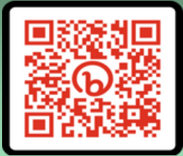
Senior Brag Sheet