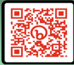
College Board SAT Practice