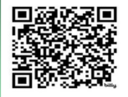
Senior Appointment Calendar