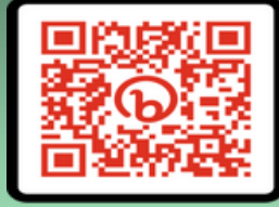
Common Black College Application