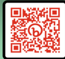
Residency Determination Service